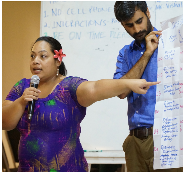
AG-Scans in action in Boivia (left) and Samoa (right)